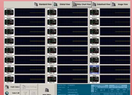
Graph View: View real-time graphs for up to 24 zones at a time.