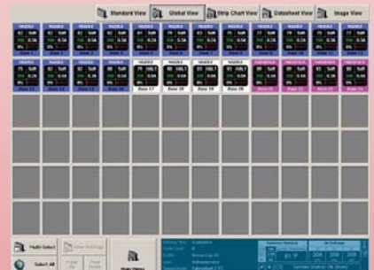
Global View: For medium density tools, global view allows up to 72 zones simultaneously.