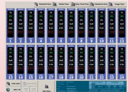
Standard View: Large format for easy reading and information at a glance.

The Q-Star Titan features an intuitive user interface. Based on Windows and MSDE database systems, the Q-Star Titan can store large amounts of data for analysis.